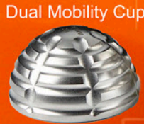
Dual Mobility Cup