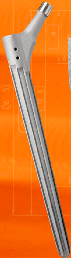
Wagner Revision Type

Aristotech® Your Orthopaedic Contract Manufacturer