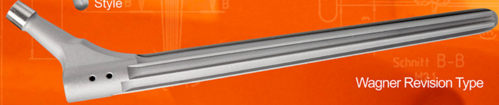
Wagner Revision Type

Forgings or Finished at NO TOOLING COSTS